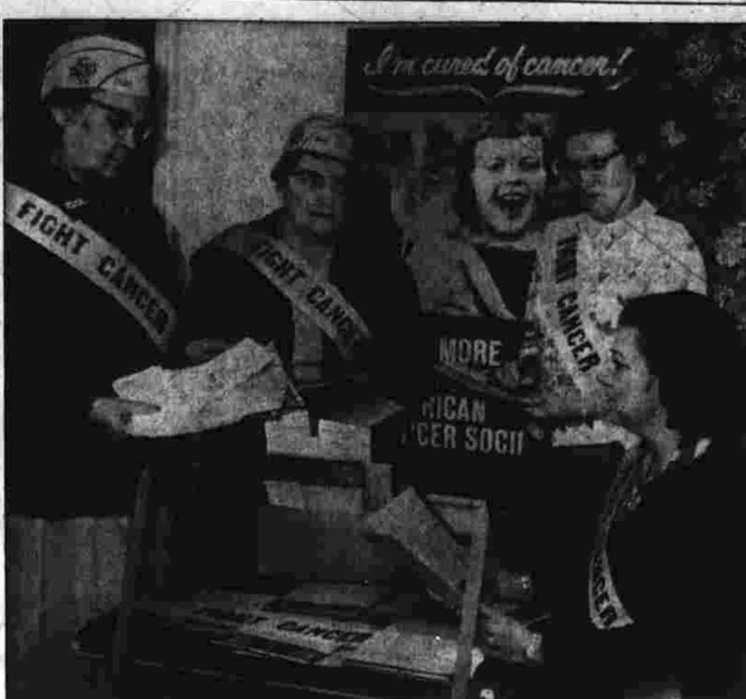
Campaigners for Cancer Society